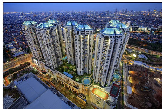
Figure 4: Jakarta apartment towers