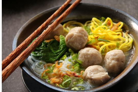
Figure 5: Mie Bakso, a popular Indonesian dish of noodle soup with meatballs