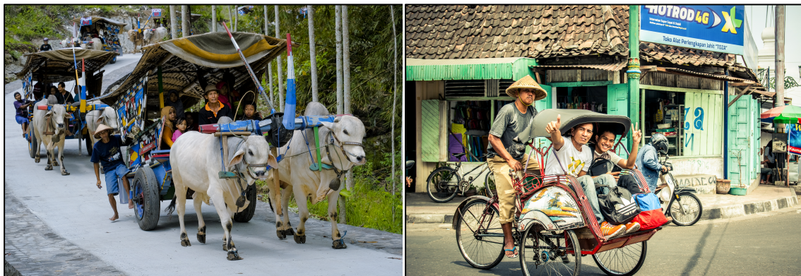
Figures 6 & 7: Examples of more traditional forms of transport, an ox-drawn cart and a becak