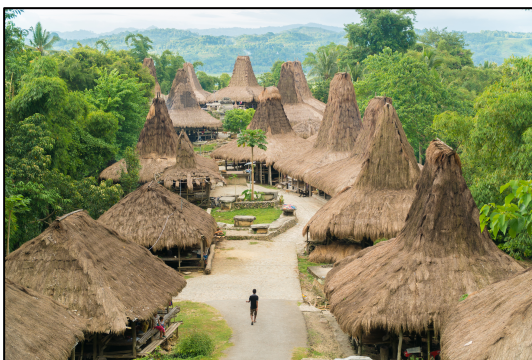
Figure 3: Traditional Kampung