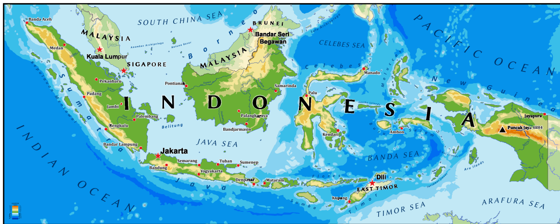
Figure 1: Map of Indonesia